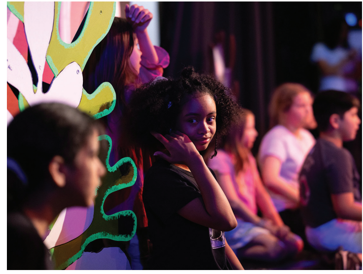
Scenes from "The Little Mermaid Jr."