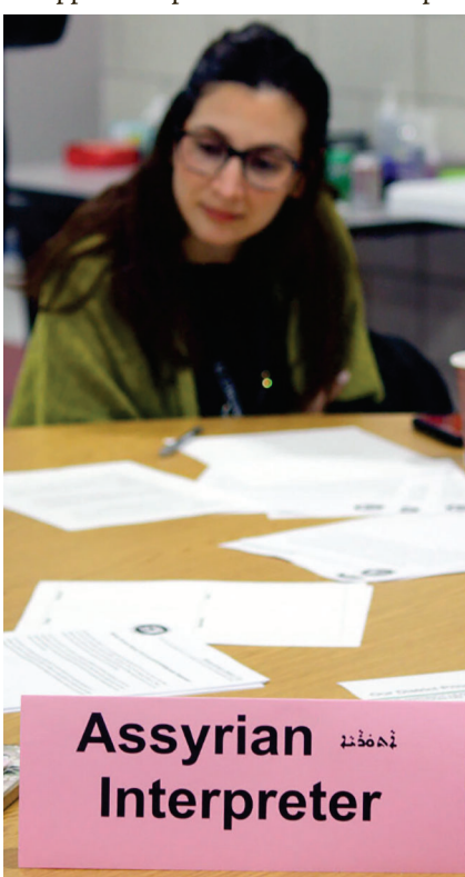
Interpreters played a key role in helping residents participate.

He said important strategic objectives in the plan include improving how the district presents itself to candidates, making the application process clearer and simpler